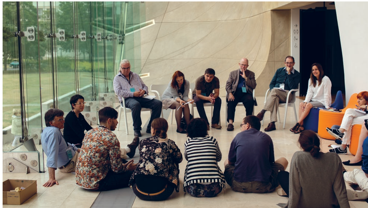
POLIN Academy Summer Seminar (PASS)