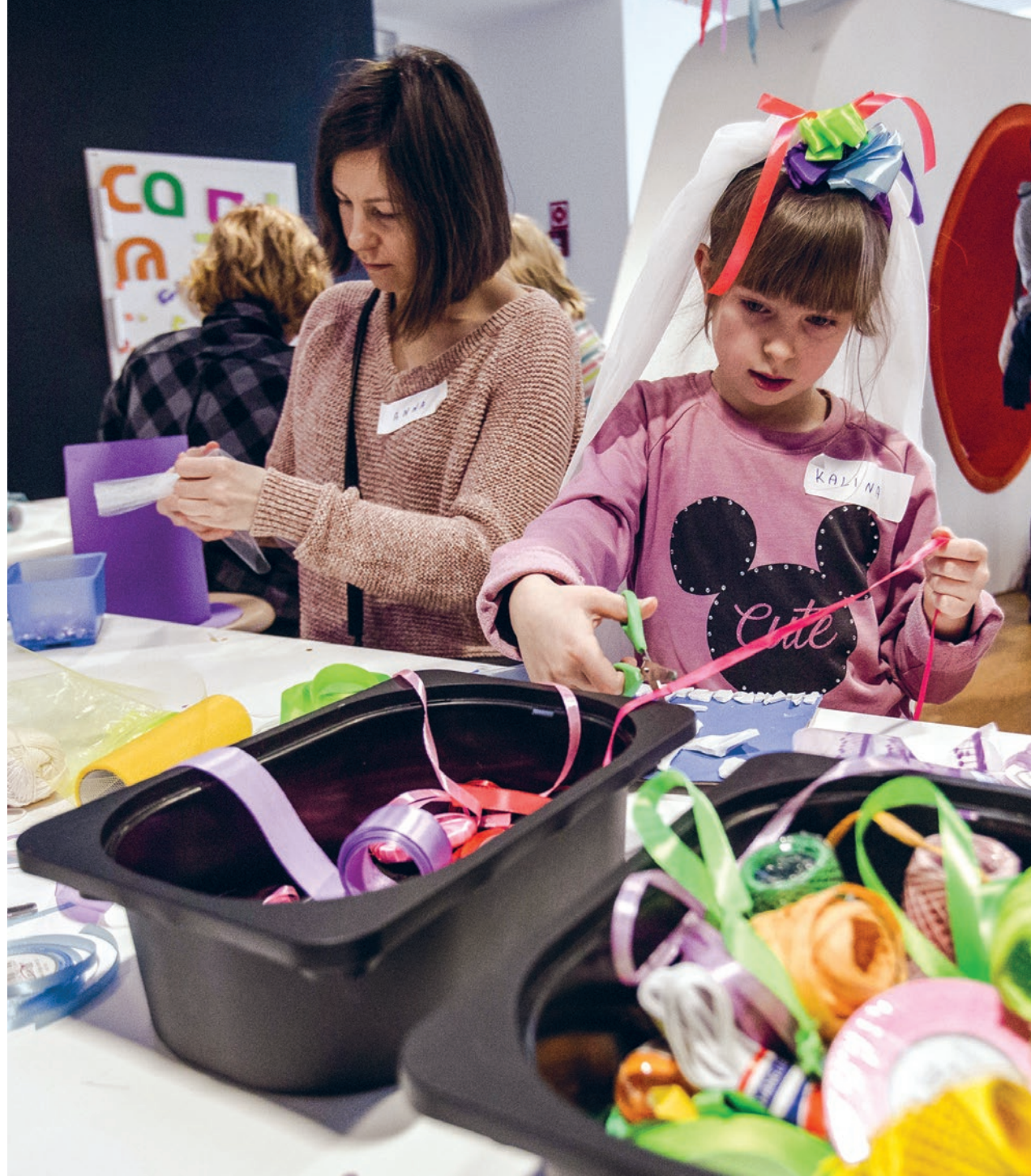
King Matt's Family Education Area