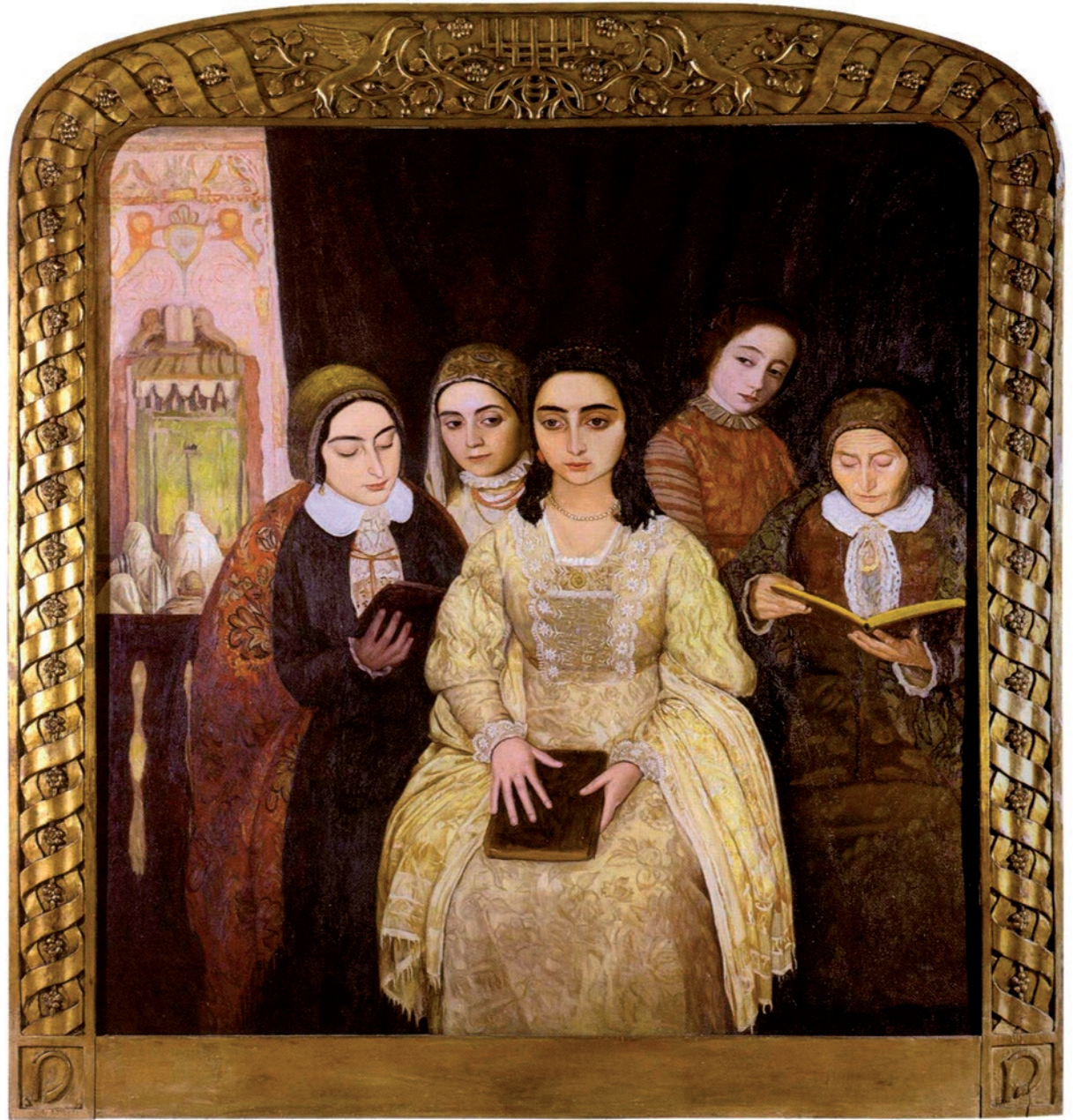
Maurycy Minkowski (1883–1930), The Bride , IWO Foundation, Buenos Aires. Planned acquisition for POLIN Museum