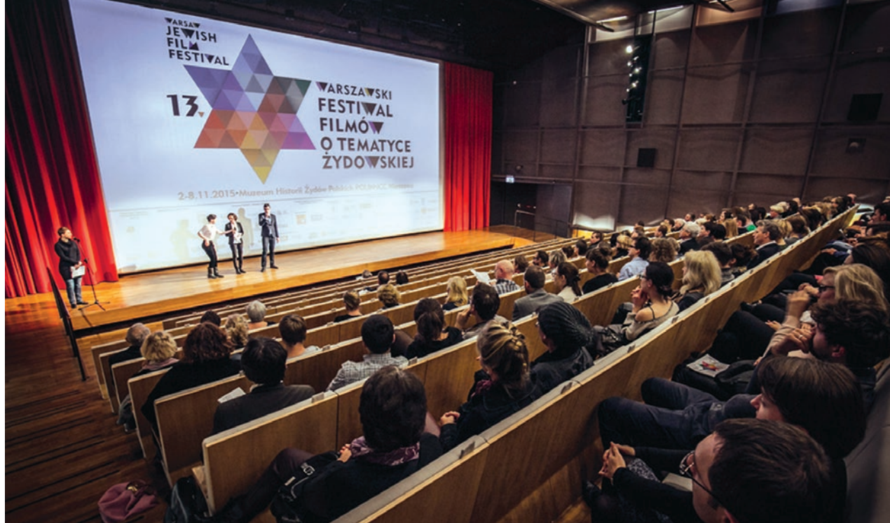
Warsaw Jewish Film Festival at POLIN Museum, November 2015

Concert of Sinfonia Varsovia, conducted by Maestro Krzysztof Penderecki, commemorating the 70 th Anniversary of the Warsaw ghetto uprising, April 2013