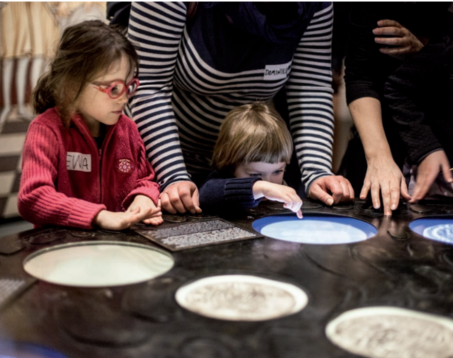
Interactive installation in the First Encounters gallery