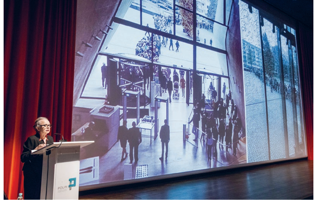
Jewish Cultural Heritage: Projects, Methods, Inspirations, conference, June 2016

International Seminars for Teachers and Educators → A partnership with Mémorial de la Shoah, CENTROPA, Yad Vashem, and Falstad Center.