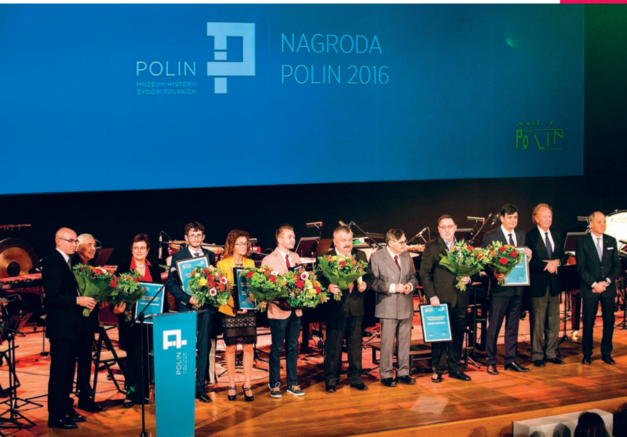
Winners and finalists of the 2016 POLIN Award

The POLIN Award Gala, an annual autumn event at POLIN Museum, marks the anniversary of the opening of the core exhibition.