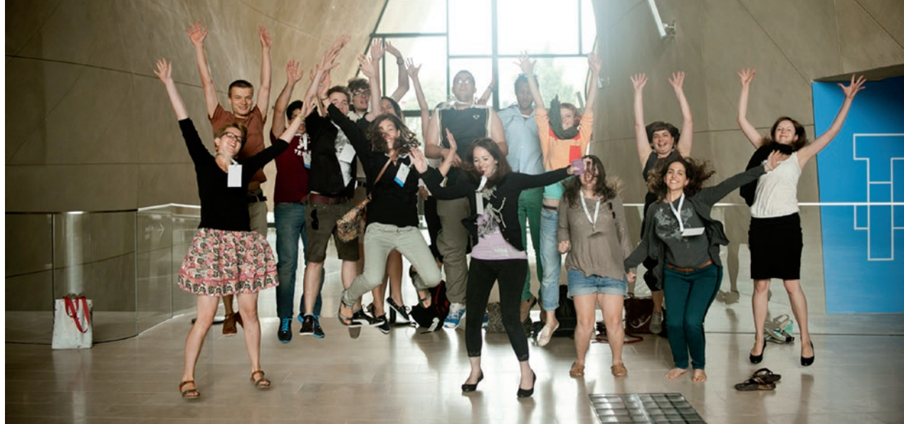
Polish-Israeli Youth Exchange, August 2014

The Ambassadors Program engages teachers in the creation of the Museum's educational program.