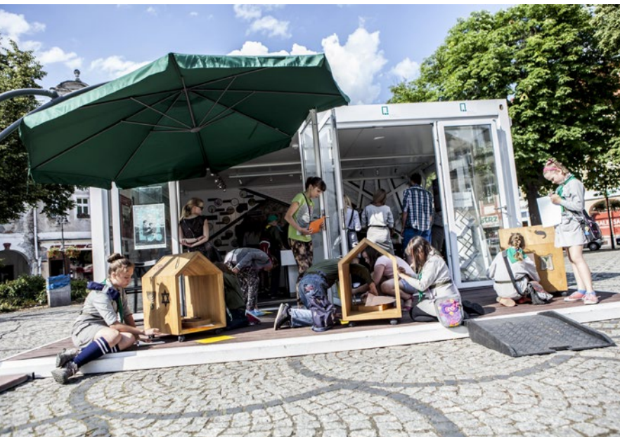
Museum on Wheels

In 2015 POLIN Museum launched a fabulously colorful space for children and their parents. Educators and artists base all activities here on Janusz Korczak's ideas, which combine learning and creative play in a family atmosphere. There are culinary workshops, theatre performances, films, concerts, activities related to Jewish holidays, and meetings with interesting guests.