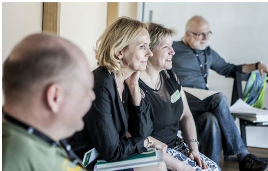
Anti-Discrimination Course for Professionals

Survivors and Rescuers → High school students make short movies based on their interviews with survivors and rescuers. The movies are premiered at POLIN Museum and featured on the Museum's website.