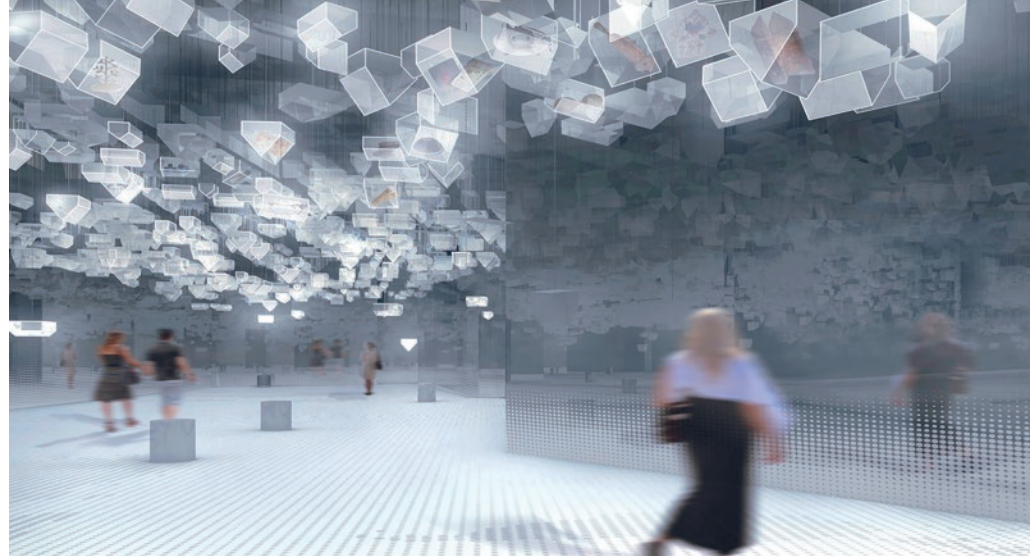
Expanded Geography: Polish Jews in the World. Epilogue to the core exhibition

Volunteers with paper daffodils, April 2016